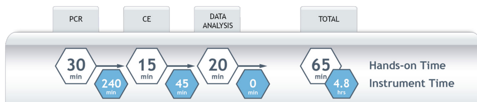
Figure 1. AmplideX PCR/CE HTT Kit Workflow.