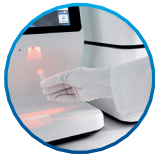
Scan sample & Cartridge