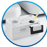
Insert sample in the Cartridge