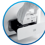
Insert Cartridge in the Idylla™ Instrument and obtain the result within 3 hours