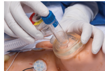
Positive pressure ventilation