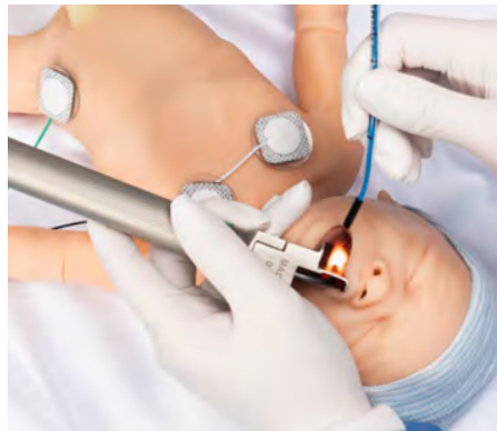
Anatomically accurate oral cavity and airway