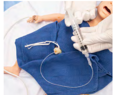
IV access on dorsum of hands, dorsum of left foot, and umbilicus