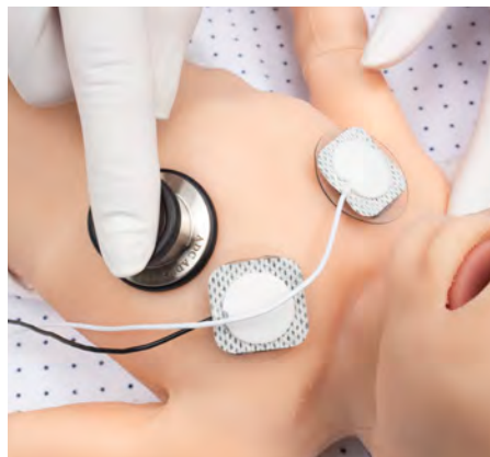
Automatic, spontaneous breathing and bilateral palpable pulses