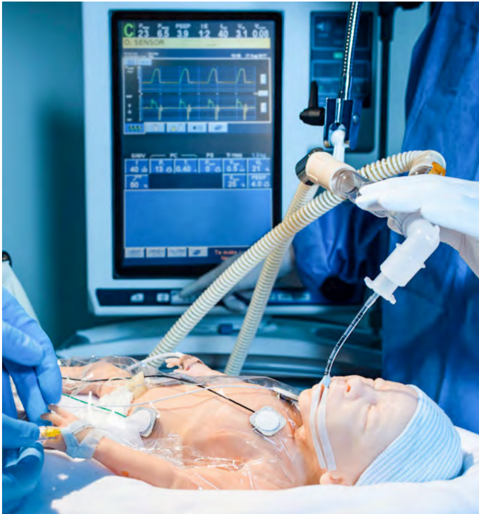
Premie HAL connected to a mechanical ventilator using a standard patient circuit.

Premie HAL® features compliant lungs that produce realistic PV waveforms on real mechanical ventilators and other respiratory equipment. This allows participants to follow guideline-recommended settings and algorithms while developing skills more directly transferable to real situations.