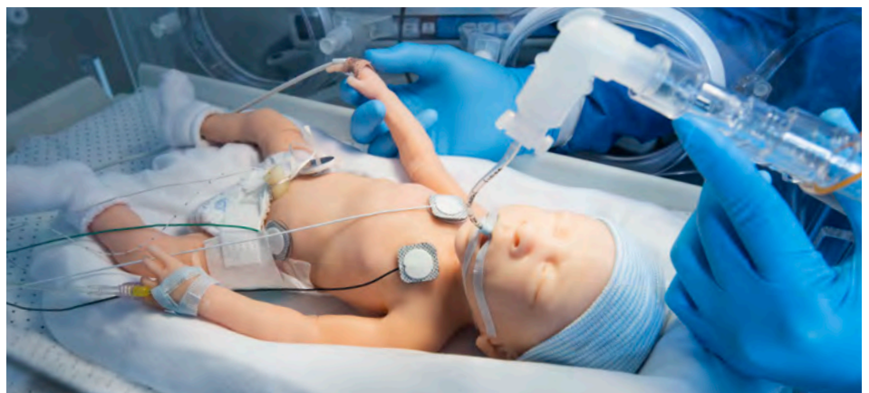
Premie HAL fully functioning inside a transport incubator.

Premie HAL is fully functional in-transit thanks to its extra-long battery life and proven wireless technology.