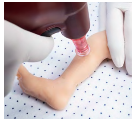
Supports IO infusions