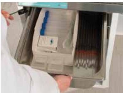
Two large volume drawers to store items needed for the procedure