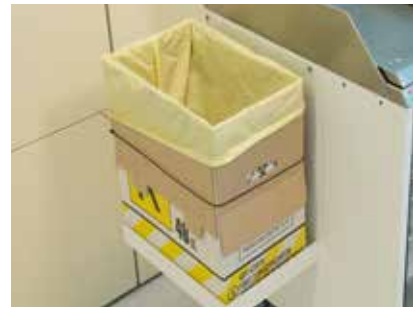
Steel support for waste disposal