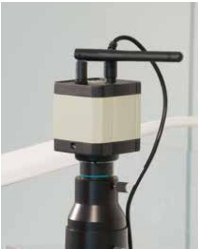
Telecytology through Wi-Fi camera or mobile devices (optional)