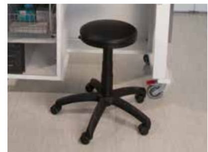
On board height adjustable stool for ergonomic work conditions