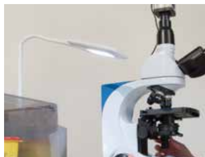
LED lamp for workbench illumination