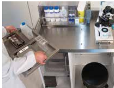
Removable work trays for easy loading and cleaning