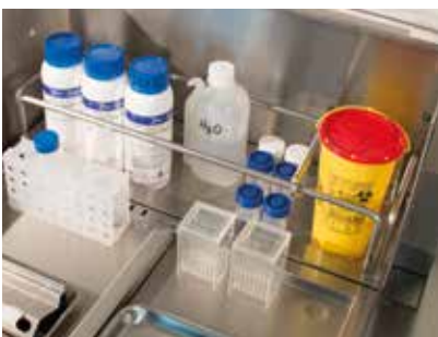
Two dedicated areas for sampling and staining with steel trays for easy cleaning