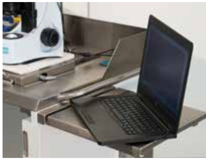
Fold-up work shelf for PC