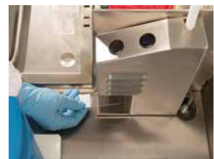
Forced air dryer for standardized drying of slides