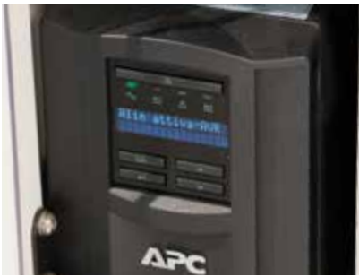
On board UPS power supply