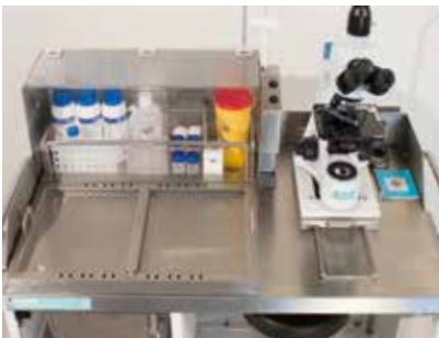
AISI 304 stainless steel cart

Each laboratory will outfit the RoseSTATION with items required according to their own standard operating procedure for ROSE.