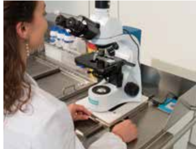
Adjustable microscope sleigh for ergonomic movement forward-backward