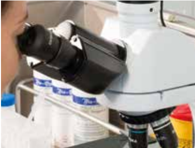
Routine microscope die-cast frame, with high stability and ergonomics, for transmitted light observation.