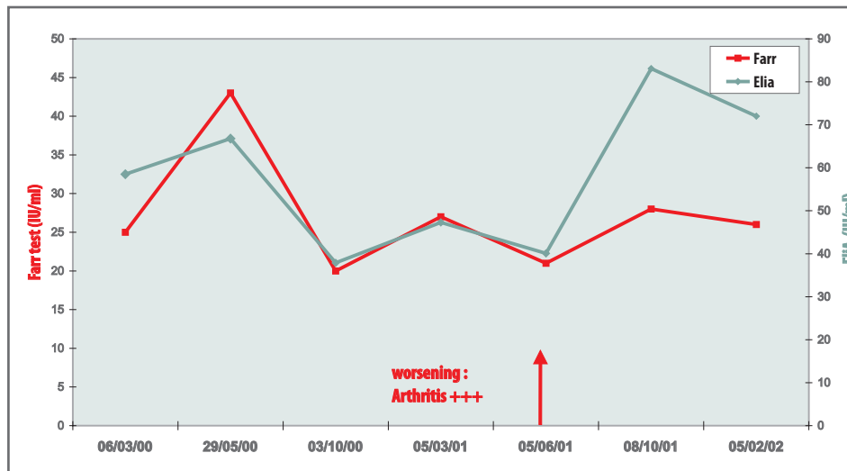
Figure 1: Patient A – Comparison of the anti-dsDNA Ab kinetics (Lakaf et al, 2002, 6 th Dresden Symposium on Autoantibodies)

In another study, EliA™ dsDNA was compared to a radioimmunoassay (FARR) in assessing the changes in titres in sera from SLE patients according to the clinical status and treatment. The authors found that the anti-dsDNA levels measured were significantly related and that EliA performed similarly to the Farr test for follow-up of SLE patients. One patient's data is illustrated below.