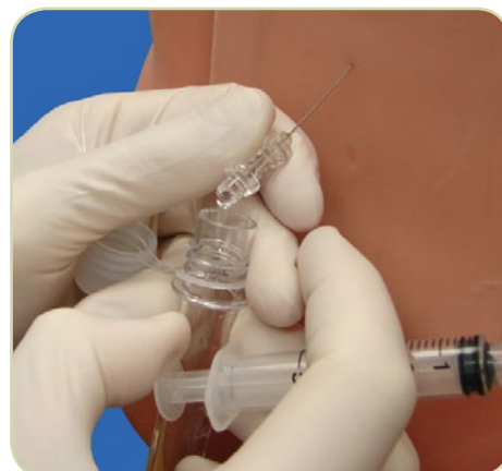
Spinal Fluid Can Be Collected