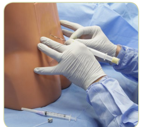
Self-sealing, Durable Tissue