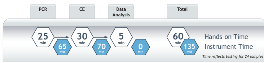
Figure 1. Assay workflow for AmplideX PCR/CE SMN1/2 Plus Kit*