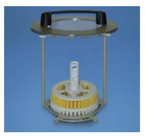
HistosMATE universal stainless steel holder suitable for all types of racks